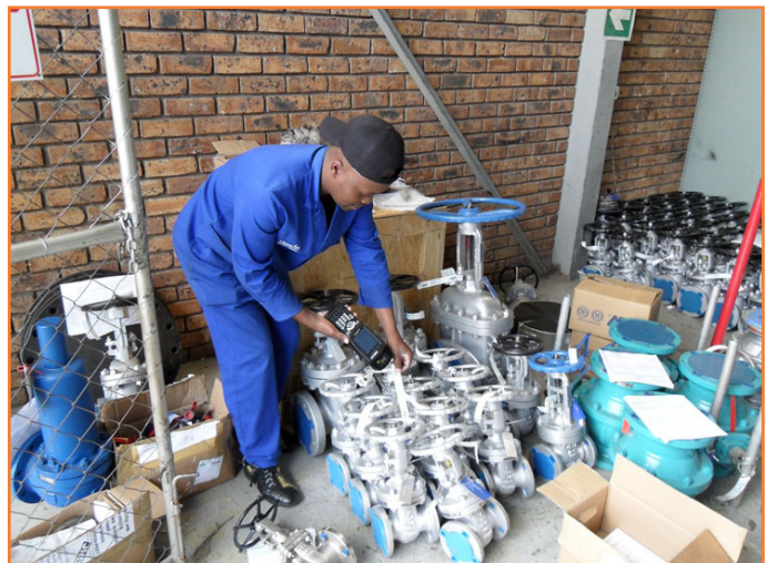
Arrival scan of RFID tags and barcodes using the handheld computer.