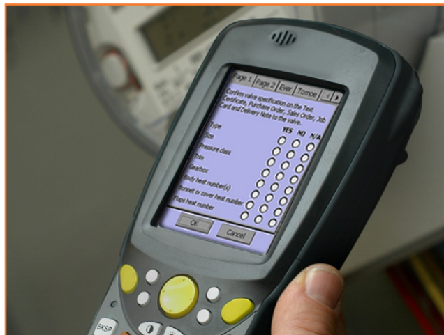
Inspection results are captured electronically on the handheld computer using a customised form.

The next phase at Heaton Valves will see the smaller stock items and consumables been managed using the Assettagz application. These items typically do not undergo individual inspections but Assettagz will enable Heaton Valves to add quantities and reduce quantities as spare parts come in and out of the warehouse. By doing this Heaton Valves will know what they have available to their customer at any point in time. In conjunction with their accounting package, they will have a near real time value of the stock in the warehouse as well as making audit counts a lot simpler and quicker, reducing costs and improving accuracy in the business.