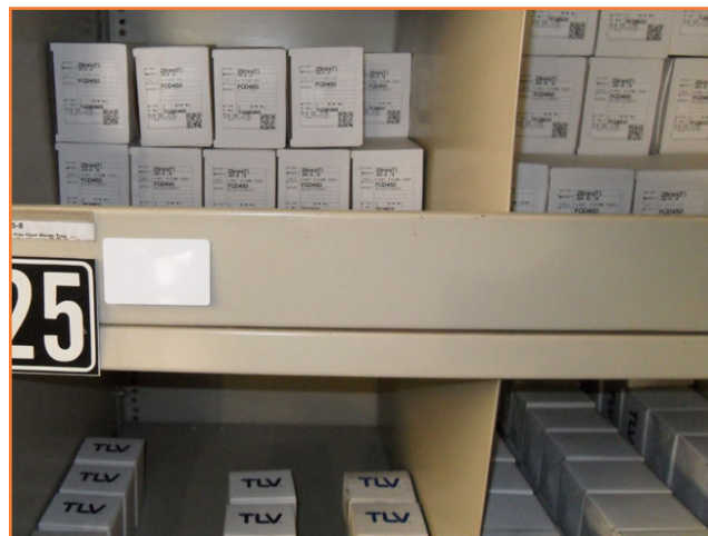
Phase II will see smaller stock items and consumables managed using Assettagz .

Greymatter Assettagz Lillipark Office Park 354 Rivonia Boulevard Rivonia South Africa 2128